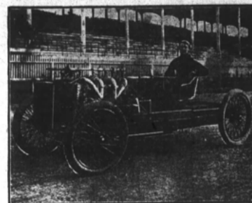
TOM COOPER. One Mile Record, 1:02 1-5; Five Mile Record, 5:14.